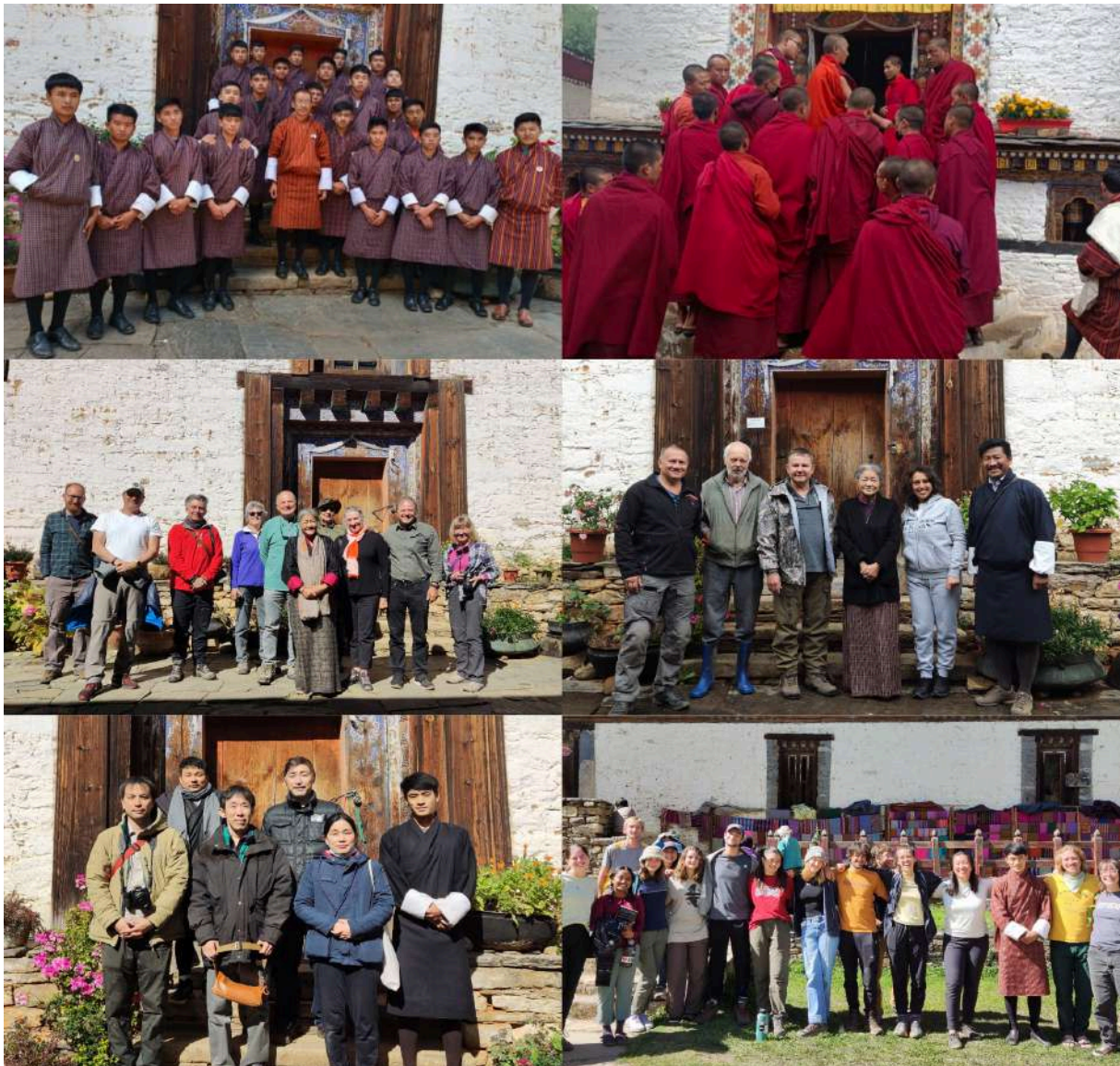
Some of the visitors to Ogyen Choling in 2022

Based on the reservations for 2023 we are optimistic that we will be able to survive the economic doldrums faced by the tourism industry.