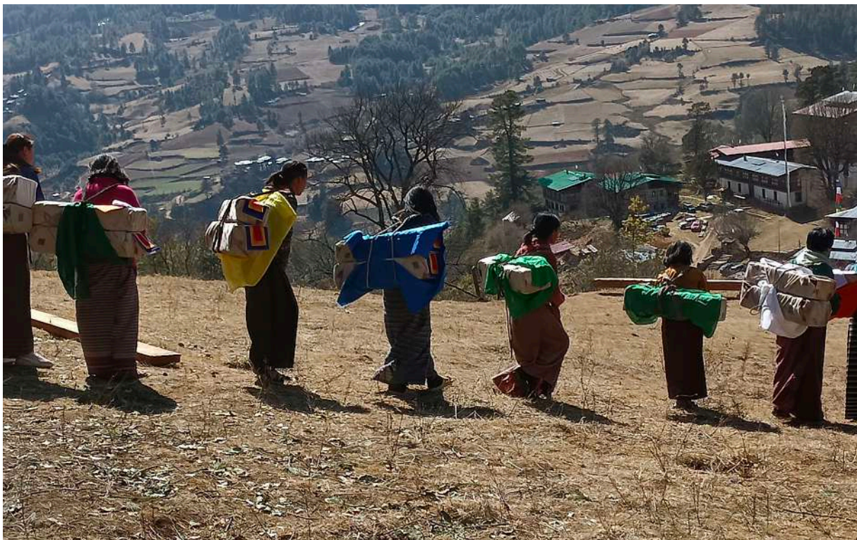
People carrying Kanjur texts

We hope that the Longchen kuchod will continue as an annual event. In consideration of Longchen’s association with Ogyen Choling, discussions have been initiated for a project to add a special shrine room for Longchen, in the main temple. It is hoped that the project will materialize in 2023.