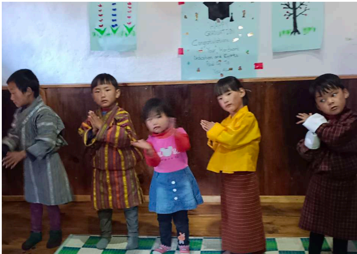
Children in the ECCD

As in the previous years the Foundation could continue to offer financial support to six children in the Khangrab Primary school. The Foundation was happy to offer cash prizes once again for the academic achievers in the three top positions in each class for all the classes in both the schools in the valley.