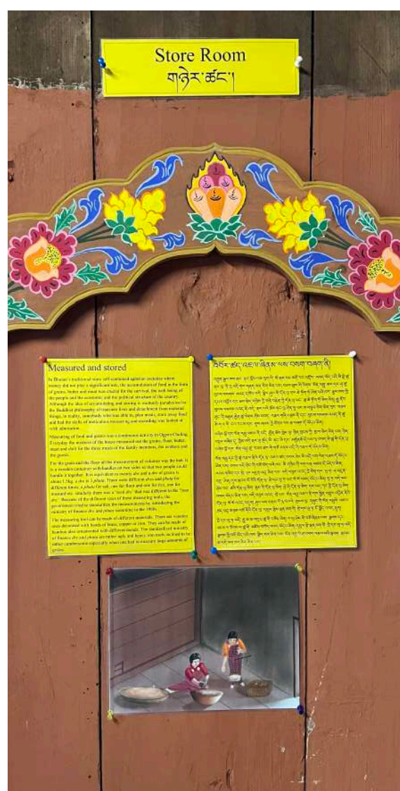
Two examples of introductory displays