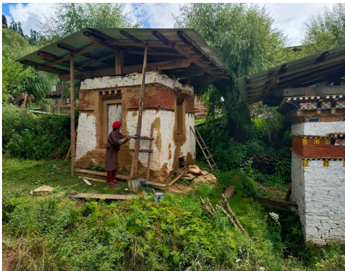
Repairing the Chukor mani at the entrance of the village

We could also respond to some unexpected ad hoc jobs that needed immediate attention. In July after a heavy spate of rain, part of the wall behind the temple collapsed. Sand, cement, and gravel were sourced immediately and brought to the site so that the repair could begin as soon as the rain stopped. The rebuilding project progressed well and will be completed in the first half of 2023.