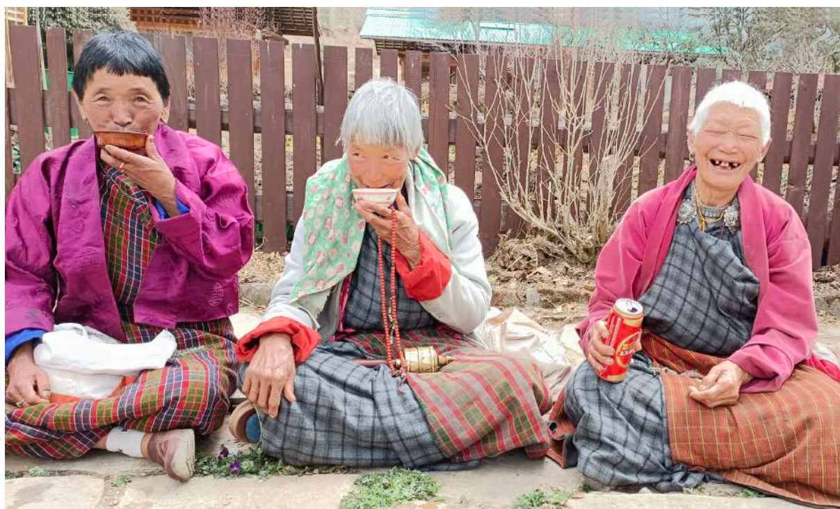
The elders from the village enjoy a drink on losar

During the last board meeting it was decided to change the reporting system. To avoid repetition, we will henceforth send out a comprehensive annual report and share updates through quarterly newsletters and regular Facebook updates.