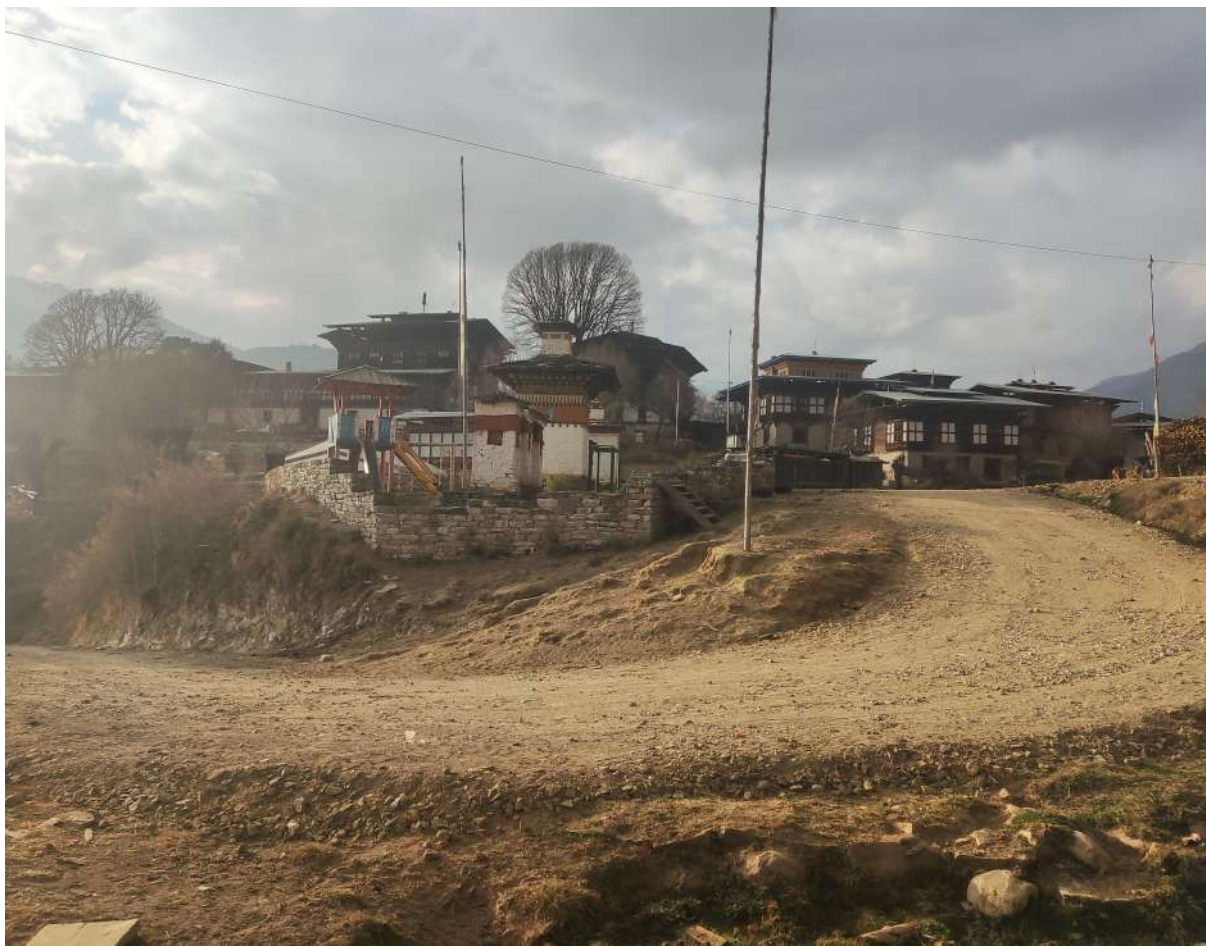
The new base course road to the Ogyen Choling village and manor

The much talked about and long-awaited improvement of Tang Road became a reality this October. The dirt road from the Gewog centre in Misithang to the end of the valley, covering 15 km, has been black topped. Similarly, the “infamously notorious” road from the Kizom bridge to the Ogyen Choling village has been consigned to history as it has been upgraded to a Base Course status in early 2023. This will not only ease the mobility for the community but will also enhance tourism.