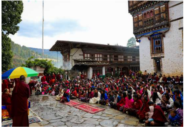
People from valley gathered in the courtyard to receive empowerment and blessing