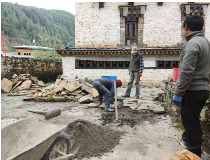
Repaired wall and the patio behind the temple