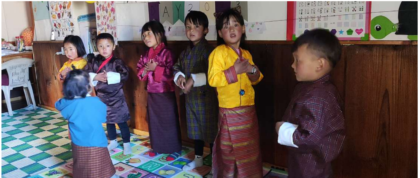
ECCD students performing songs and dances on the final day of school

The academic prizes for the two schools could be offered to the top performers. The cash prizes were distributed on national day.