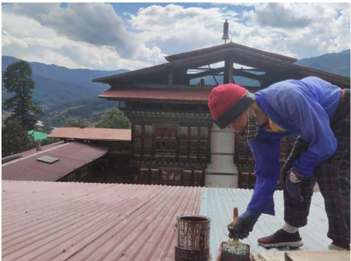
Completing the painting of the temple roof

We are happy that we could increase the security by adding more lights in the compound as well as a camera near the chorten at the south end of the compound. Unfortunately, we could not get the smoke and burglar alarm system back into operation. Hopefully the problem will be solved early in 2024.