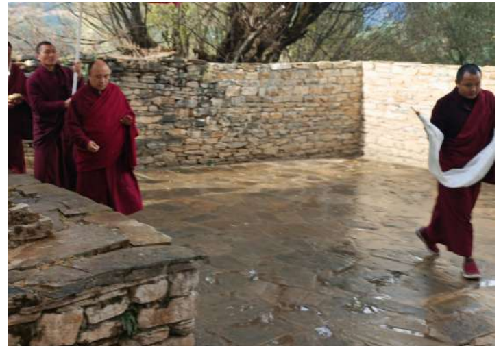
Namkhai Nyingpo Rinpoche blessing the repaired monuments