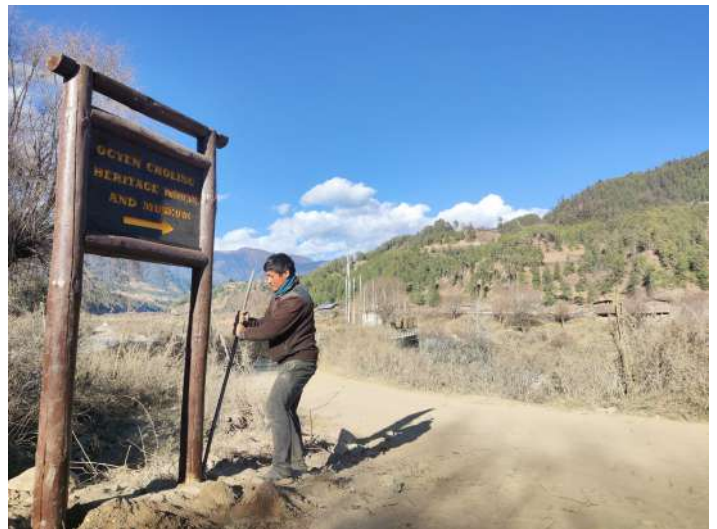
Putting up a new signboard to the museum