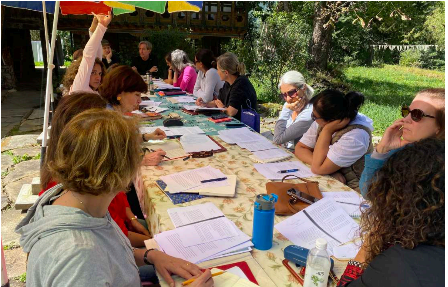
Attendees at the writer's workshop in a group session in the sun

With the extended stays of three scholars in Ogyen Choling over the summer, we feel optimistic that one of the main objectives of the Foundations, to host scholars is being realized (see the quarterly newsletter of April- June 2023 for more details of these visits).