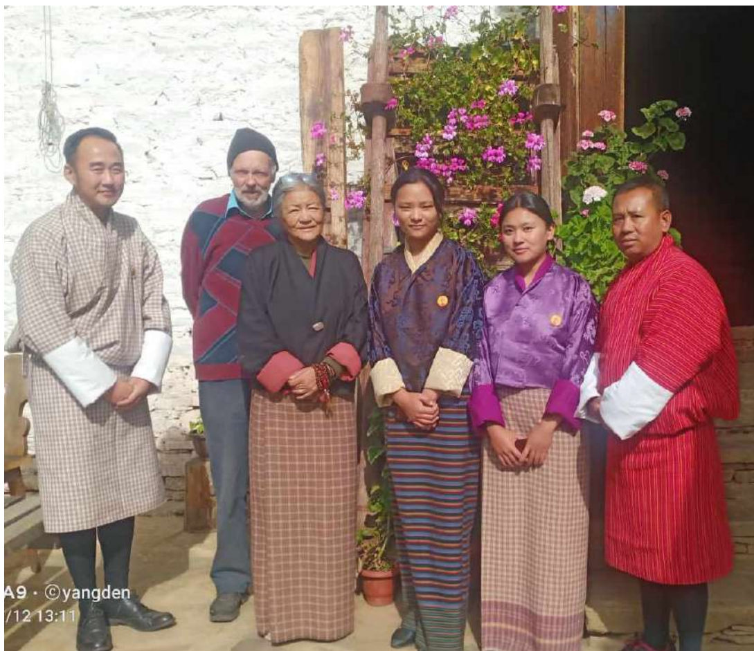
CSOA officers in Ogyen Choling on an evaluation of the accountability standards

Concerted efforts were made by board members and the Executive Director to generate and finalize the Accountability Standards as required by the CSOA. The resulting guidelines will help to guide us in our day-to-day management of the Foundation.