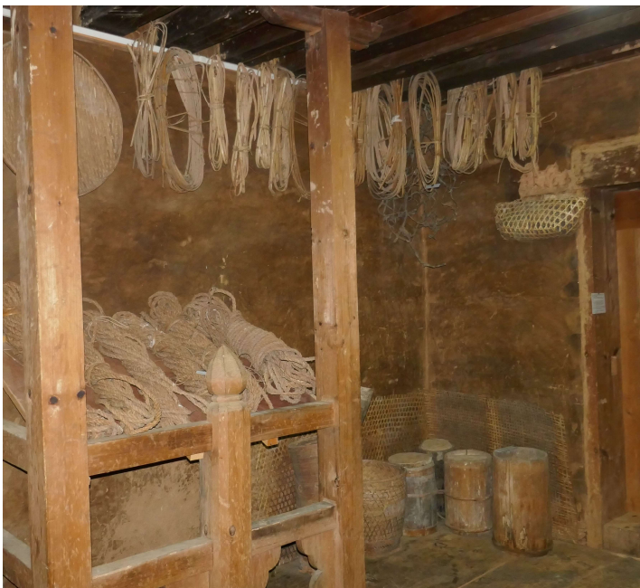
Bamboo and cane artefacts