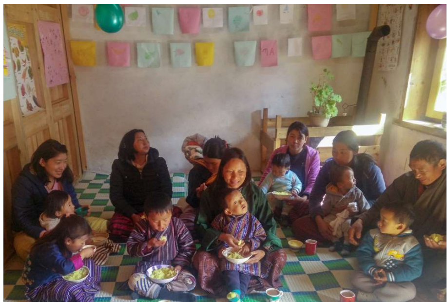
ECCD opening, just few days before closing on 6 th March

Considering the concerns of the local population and the directives of the Government the museum, the ECCD and the guest house were closed to visitors starting from 6 th March. This will have strong implication for the funds available to the Foundation as the income from tickets sale and lease payments of the guest house accounted for more than 50% of the expected income for 2020. We are, however, confident that the cost for the permanent employees can be covered from the limited resources.