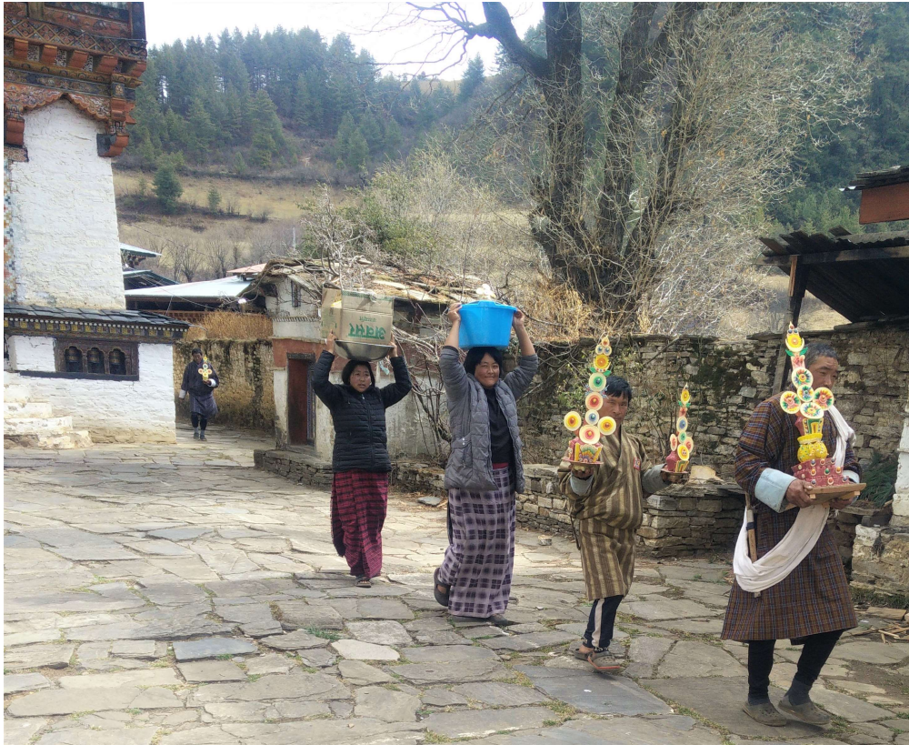
Carrying the torma and other offerings to the village after the Shingdrup prayers

Shingdrup prayers: For the first time this year the villagers jointly sponsored the Shingdrup prayers for three days. We hope that this joint prayers can be continued in the future.