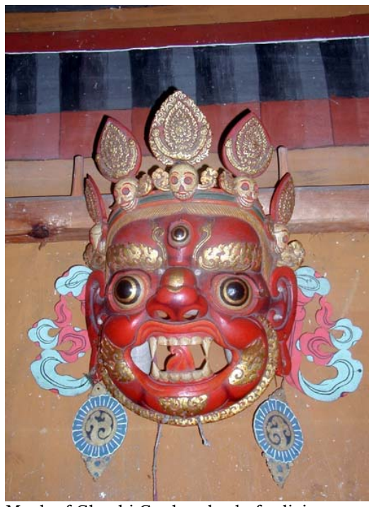
Mask of Choeki Gyalpo, lord of religion