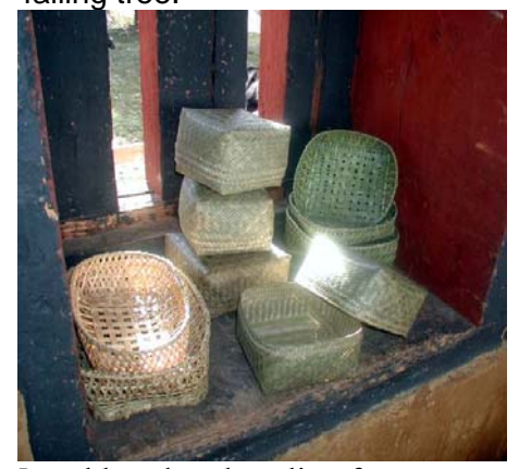
Local bamboo handicrafts

Visitors coming to Ogyen Choling because of the museum, contribute towards achieving the objective of enhancing traditional skills by providing an outlet for the local handicrafts. The weavers of Ogyen Choling who supplied fabrics to the handicraft shop realized that there is a good market potential for textiles made from local wool using only natural dyes. This has encouraged them to use these materials rather than using imported wool. Four craftsmen making bamboo products have become regular suppliers to the gift shop. One of them is a young man who is paralyzed from the waist down after he was crushed by a falling tree.