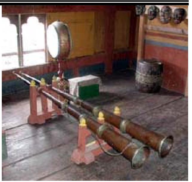
Temple horns and drums

The Institute of Language and Culture, Simthoka, has verbally agreed to help with the translation of the labels and narratives into Dzongkhag.