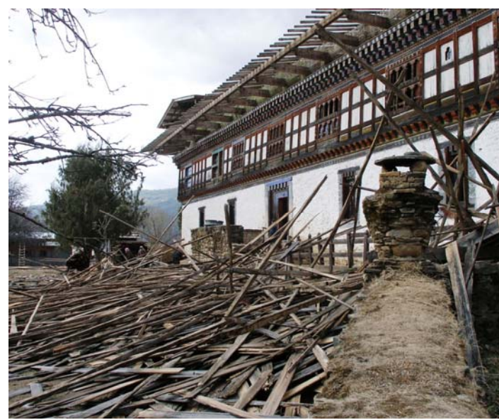
Roofing of shakor under progress (east side)

While all the roofing materials were still carried up to the Ogyen Choling nagtshang by people, the newly made road helped to reduce the transportation problem. Most of the required construction materials, such as iron rods, cement, sand and stones could be transported to the site by tractors.