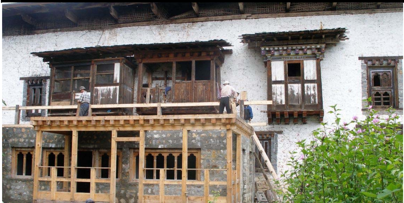
Kitchen and bathroom annex (west side)