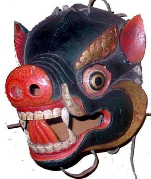
Mask of pig face (Ogyen Choling museum)

<sup>1</sup>Temple care taker and assistant curator