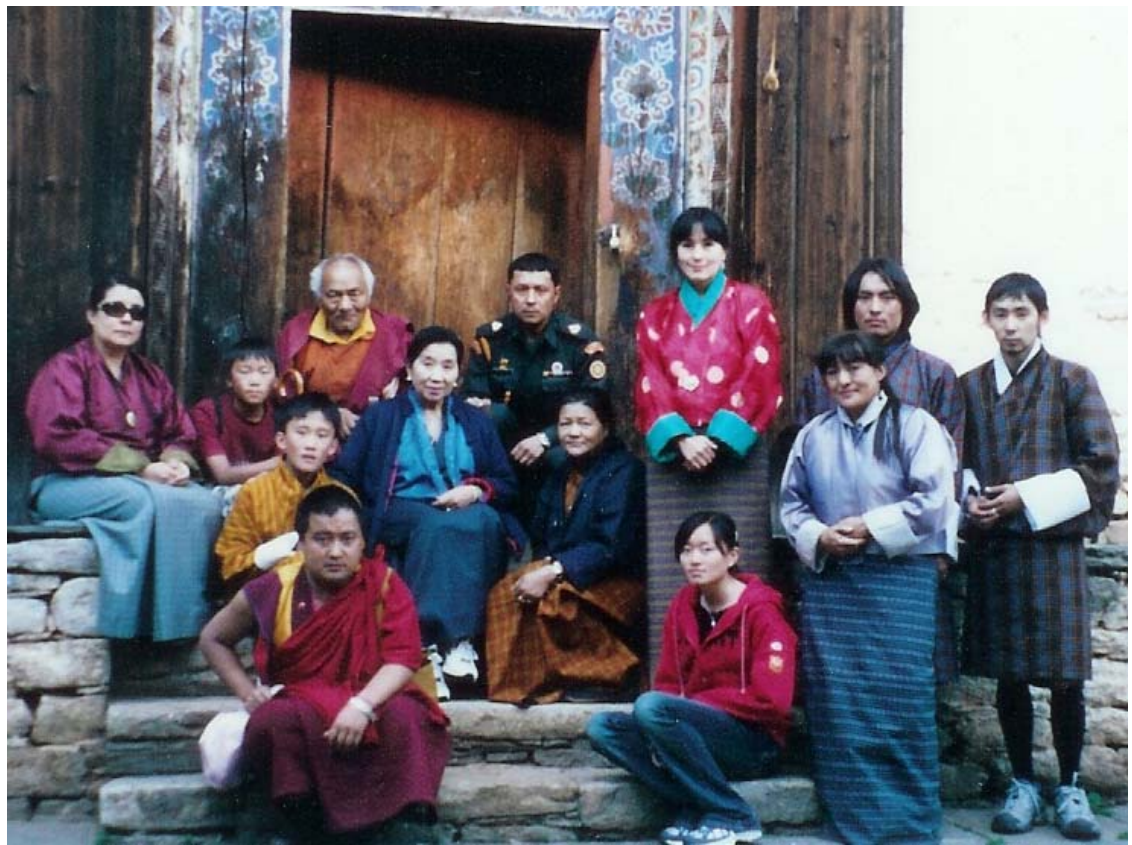
Royal visitors to Ogyen Choling; Her Majesty the Queen Mother and entourage

With the increase in size (area and exhibits) routine cleaning and maintenance work require increasingly more effort. Preservation of artefacts continues to be a major concern. Many visitors and well wishers have offered advice, but so far no realistic and practical solutions could be found.