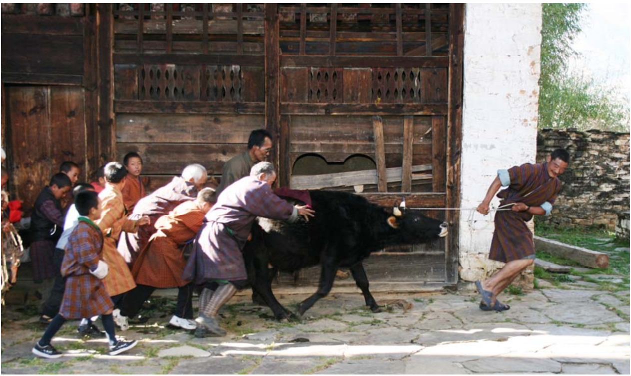
Although the yak was missing the young bull put up quite a show

The monthly prayers and rituals have been conducted regularly, and annual prayer of three days, Kangsoe was well attended. The good attendance ensures that the ceremony of the taking down the flag and hoisting it again becomes easier. Unfortunately the floods earlier in the year washed away a footbridge across the river up the valley and the yak could not be represented at the procession of animals during the festival.