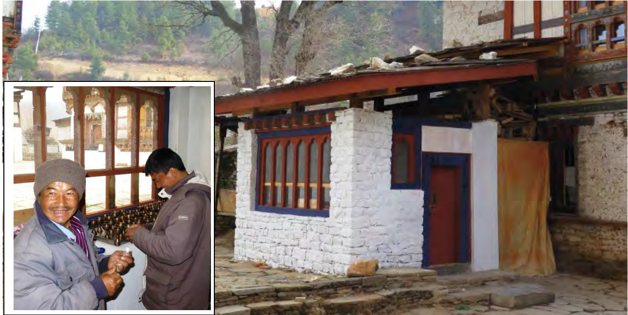
Room for butter lamps built into the corner of the shagor wall – and making lamps ready for offering

Repair of the temple stairs: The steep and potentially dangerous stairs leading to the upper floor in the temple has long been a matter of concern. The steps were worn out and slippery from more than a hundred years of use and required attentive maneuvering even for local visitors. During the visit of the Home Secretary, there was an incident which could have been serious. This definitely added to the urgency of addressing the problem. We are happy that we found a solution which allowed us to keep the original stairs by replacing the most worn out parts with wood strips and changing the inclination of the stairs. The repaired stairs feel a little hard on the feet right now but will soften with age and use.