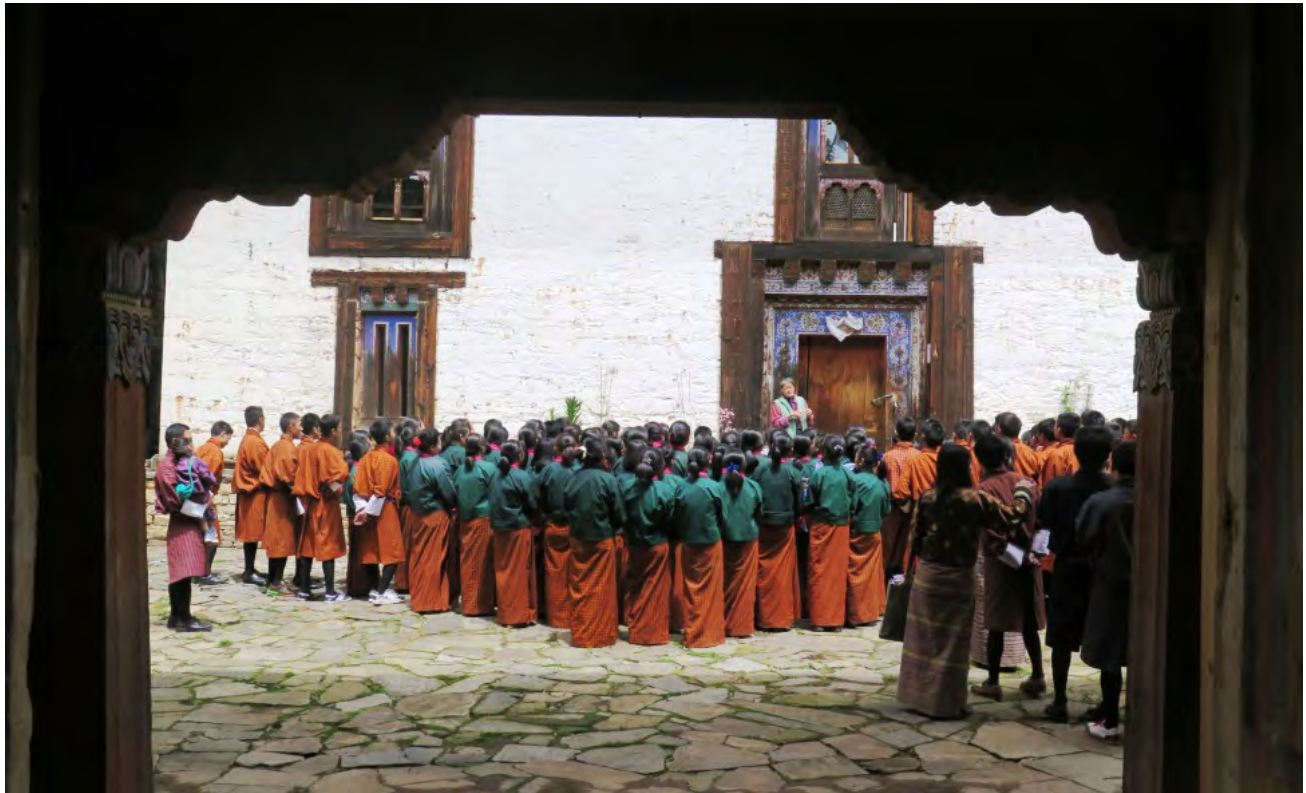
Students being introduced to the museum