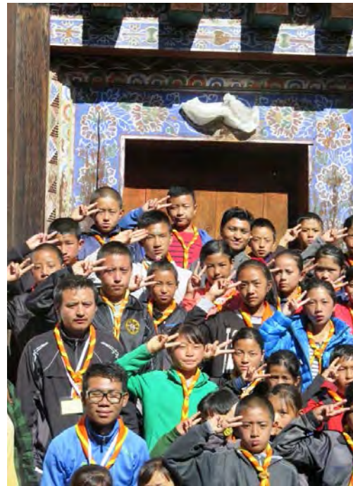
Scouts salute in front of the museum

We are gratified that more and more schools and educational institutes recognize Ogyen Choling Museum as a worthwhile place to visit and now send their students here regularly. For example, the scouts of Bumthang had their summer camp in Misethang Central School and over three days, 220 scouts visited the museum.