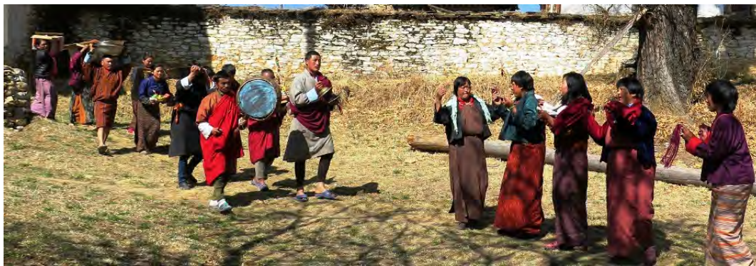
Choedpa procession leaving the temple for the village

Shortly after the new year celebrations, the village observed their annual choedpa prayers. The whole village came together for the prayers which was conducted in the Ogyen Choling temple. It is an old practice whereby every year a different village household assumes the lead responsibility for the observance of the ritual.