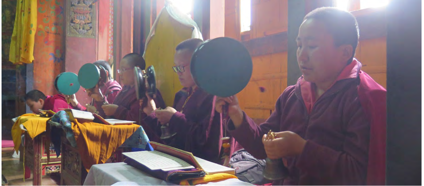
Nuns performing the ritual of choed