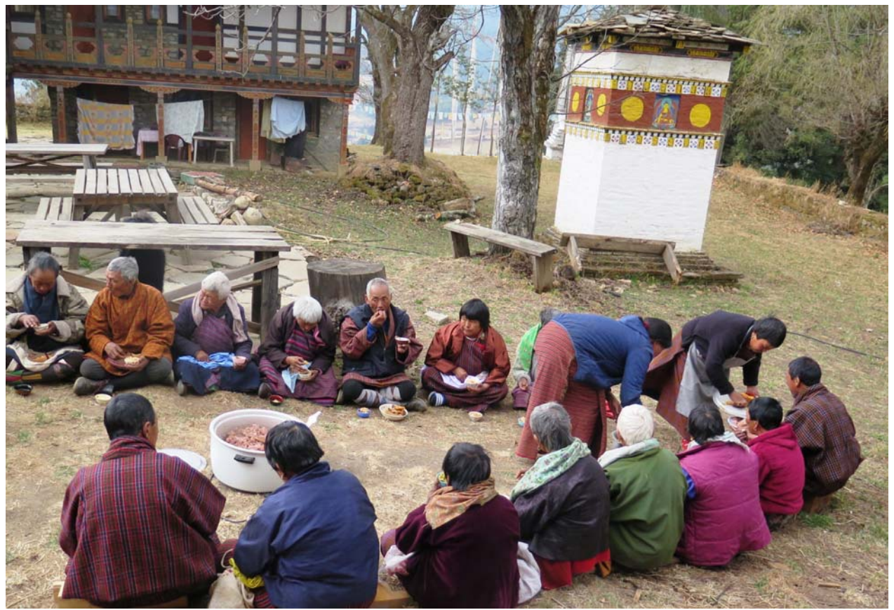
Guests enjoying the Losar lunch

The year of the Female Fire Bird began, as usual, by celebrating losar , the lunar new year, with the community on the 27<sup>th</sup> of February. There were around fifty people who participated in the celebration.