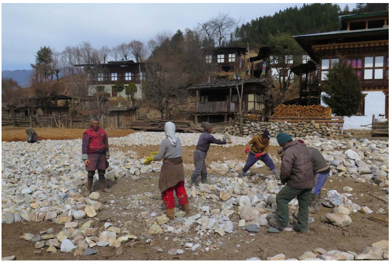
The villagers working on the road

Village improving road: This year Ogyen Choling was fortunate to receive a grant from the gewog development fund of Nu 400,000. Twenty households spent about forty days each working on the road and the "village square". Although they could not get the roller to work on the road, the condition of the road has greatly improved.