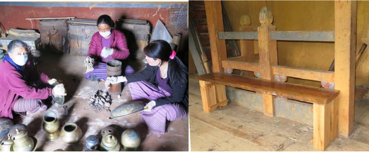
Cleaning artefacts and making inventory

Inventories: Work on various inventories continues.