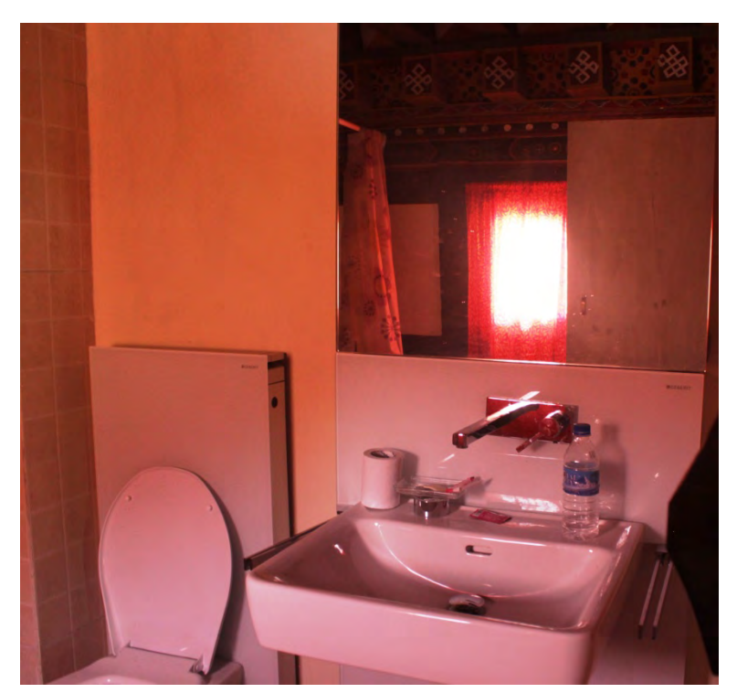
Picture of a new bathroom with the traditional window façade seen in the mirror

install modern, European standard sanitary amenities (shower, toilet, washbasin). Our first guests to enjoy the room expressed their satisfaction.