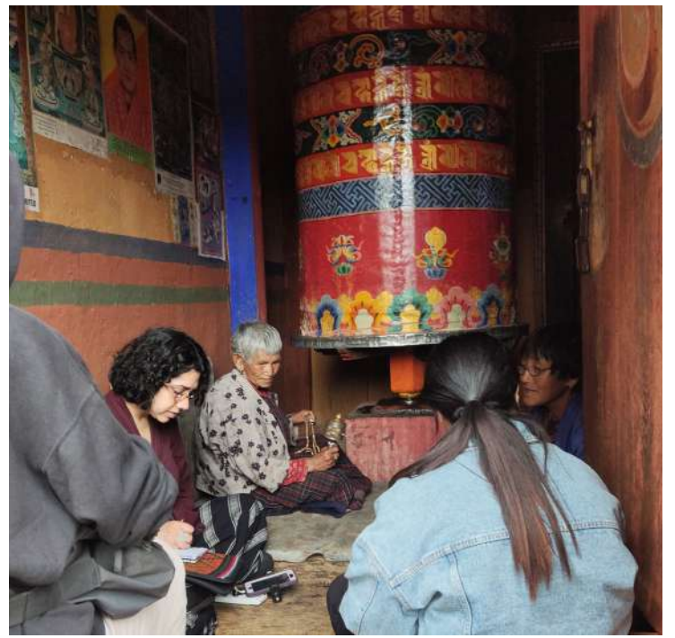
The Three Scholars