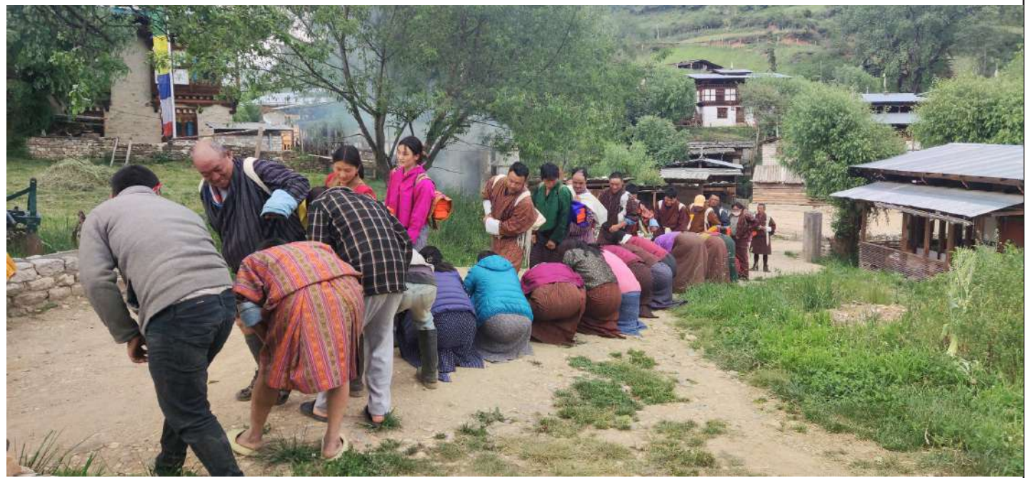
Choekhor: People lining up to take blessing from the sacred texts

Many people in Bhutan became anxious because of the delayed rains this summer. Some farming communities resorted to the ritual of choekor or seeking blessings for rain. In Tang valley too by early June different communities carried the sacred texts of Kangjur and went in processions around the fields.