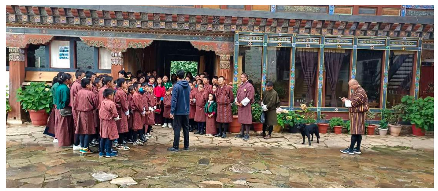
Recieving 65 students from Dhur Primary School in Chokhor Gewog