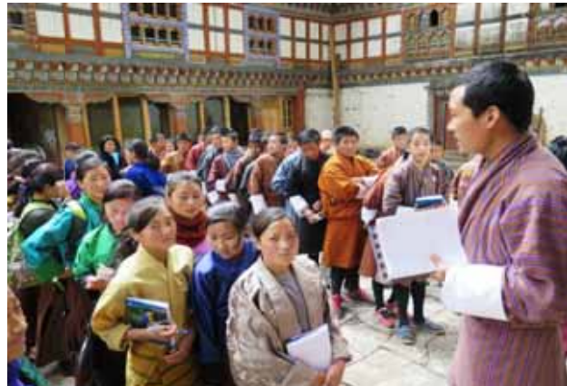
Students of Misithang school

On the 28 th of April, 26 Third Year students of the Institute of Language and Culture Studies (ILCS) in Trongsa visited the museum and later held a discussion on literature based on my book, "Circle of Karma". We were pleased to provide them lunch and tea and snacks