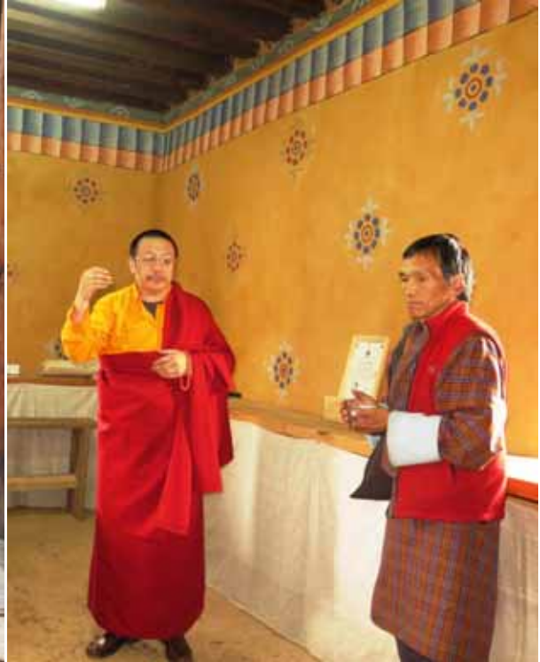
The foundation office being blessed by HH Choning Rangshar Rinpoche